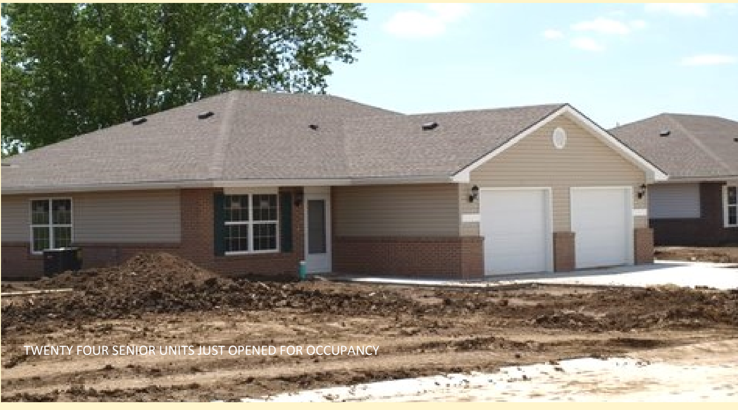
TWENTY FOUR SENIOR UNITS JUST OPENED FOR OCCUPANCY