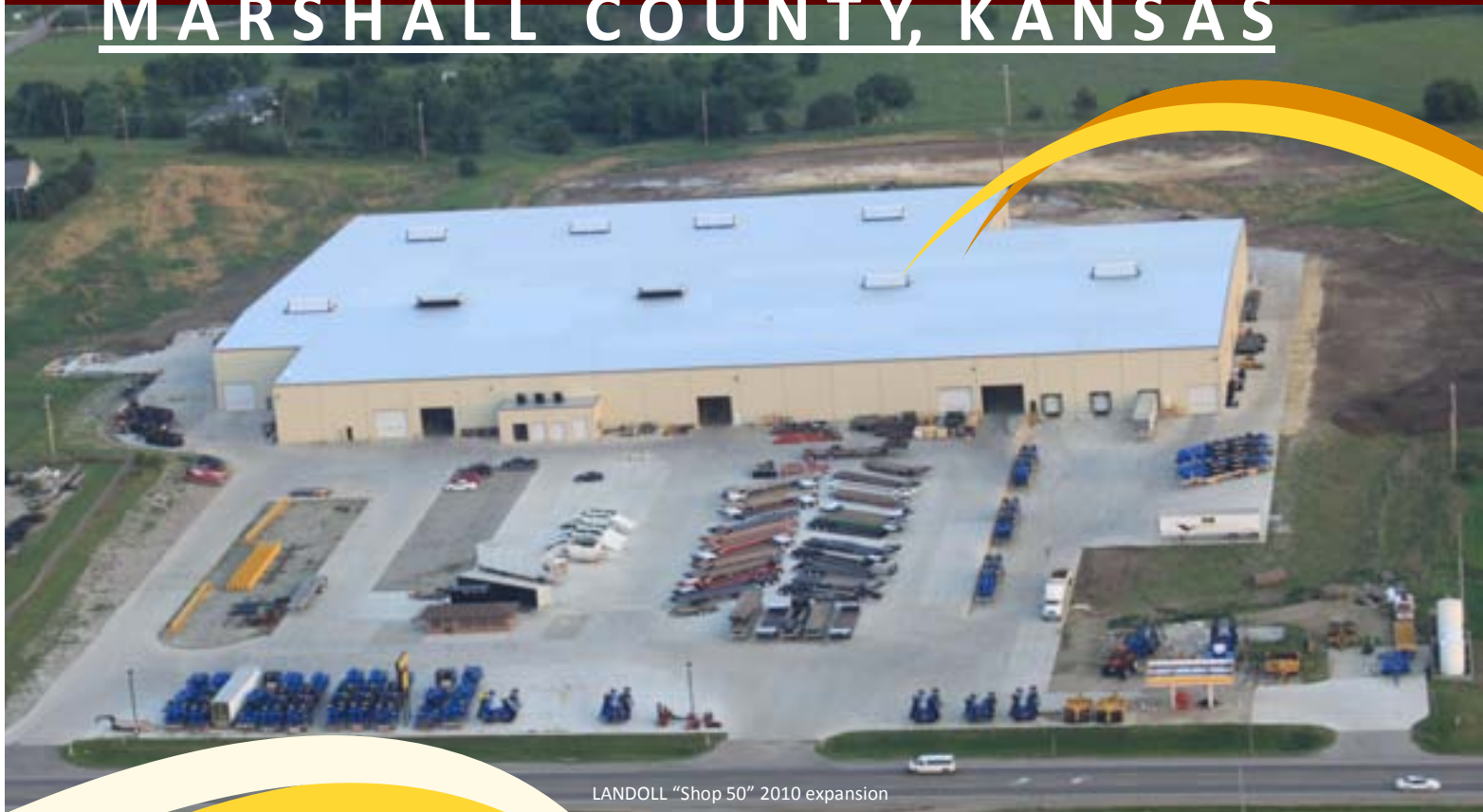
LANDOLL "Shop 50" 2010 expansion